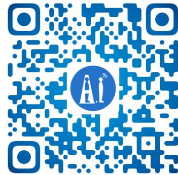
WeChat official account