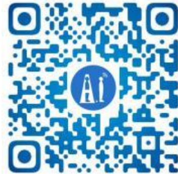
WeChat official account